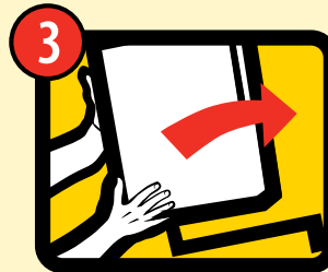
Place on Ecobox™ rack