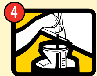
Open spout to pour oil into pitcher