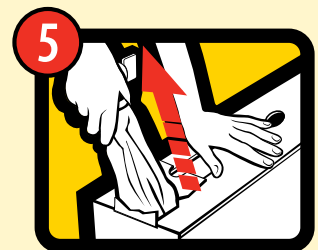
When box is empty, pull tap and bag from box. Properly dispose of box. Always recycle where possible!